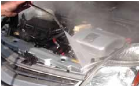
Independent workshop (No covering of sensitive area)