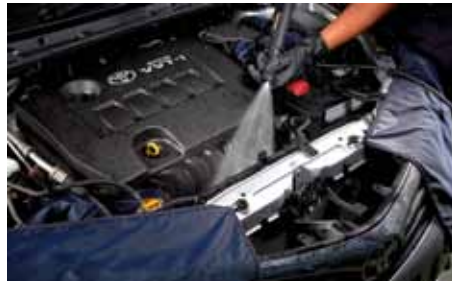
Toyota Service Centre (Protective cover on sensitive areas)