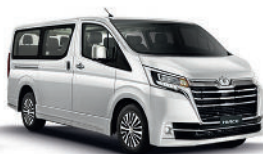
White Pearl Crystal Shine