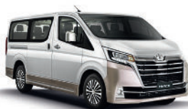
Luxury Pearl Toning