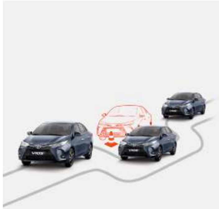
ANTI-LOCK BRAKE SYSTEM Prevents your wheels from locking up and allows you to steer during sudden hard braking.

We make sure you get to drive with peace of mind with the Vios' advanced safety technologies and security features that keep you and your family safe.