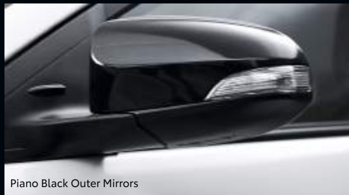
Piano Black Outer Mirrors