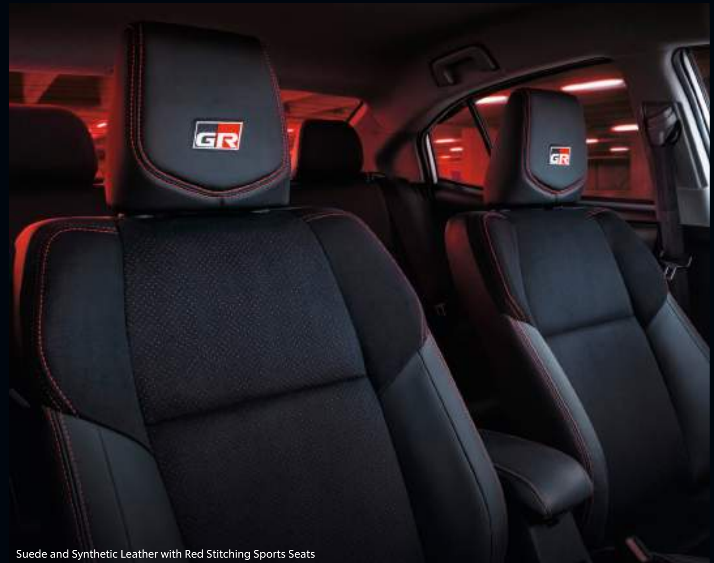
Suede and Synthetic Leather with Red Stitching Sports Seats