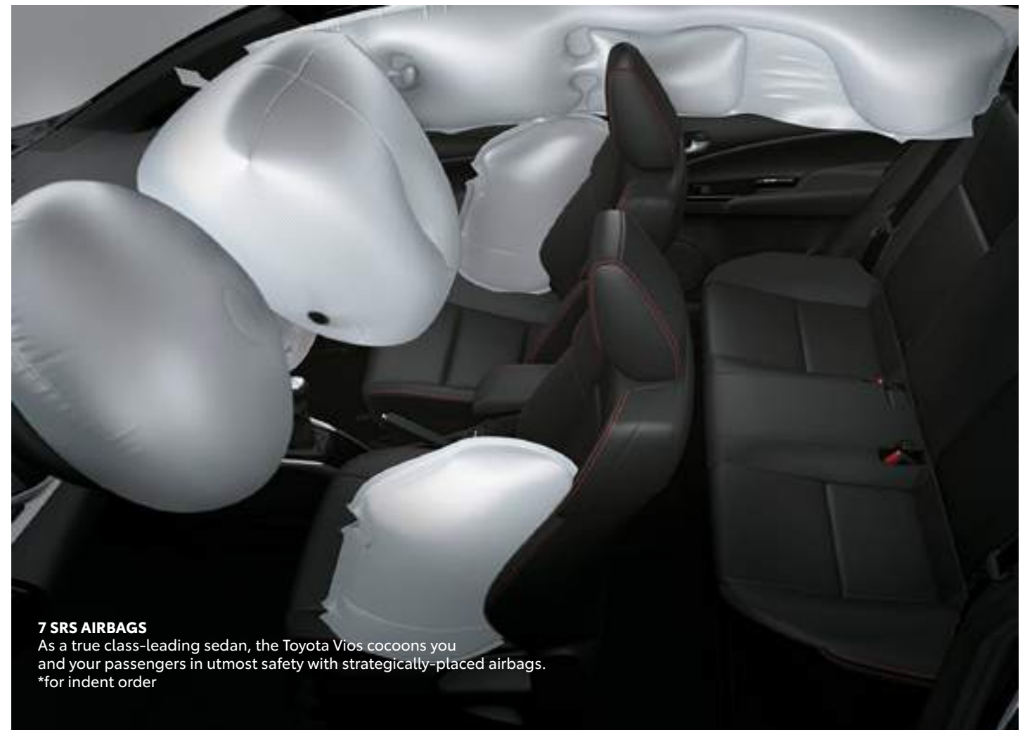
7 SRS AIRBAGS As a true class-leading sedan, the Toyota Vios cocoons you and your passengers in utmost safety with strategically-placed airbags. *for indent order