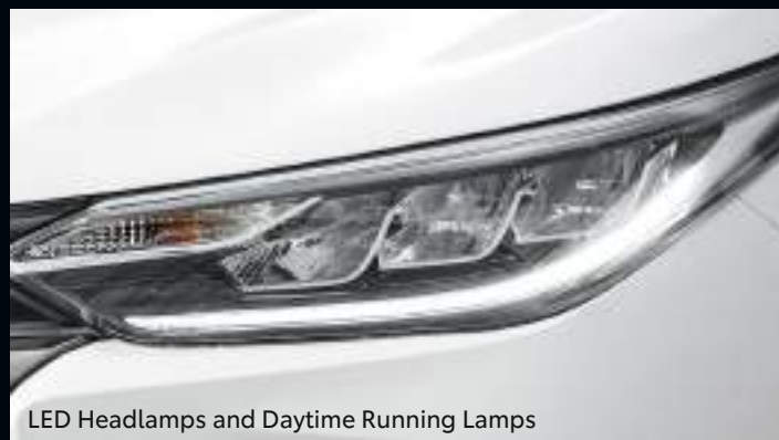
LED Headlamps and Daytime Running Lamps