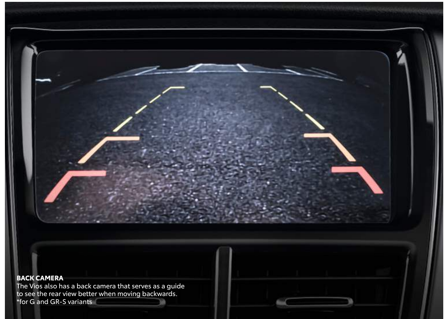
BACK CAMERA The Vios also has a back camera that serves as a guide to see the rear view better when moving backwards. *for G and GR-S variants