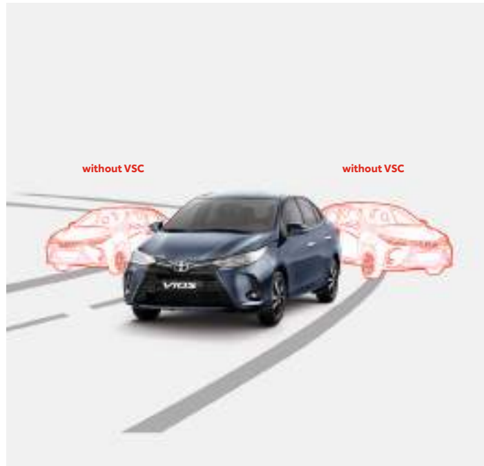
VEHICLE STABILITY CONTROL Keeps you safe by helping you prevent side skids and assists in stabilizing the car when abruptly turning on a tight curve.