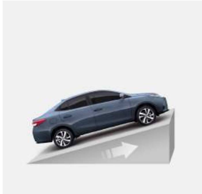
HILL-START ASSIST CONTROL Safely advance from a full stop with ease when you're going uphill.