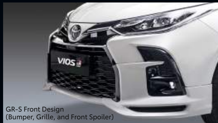
GR-S Front Design (Bumper, Grille, and Front Spoiler)