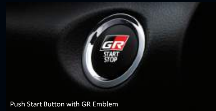
Push Start Button with GR Emblem