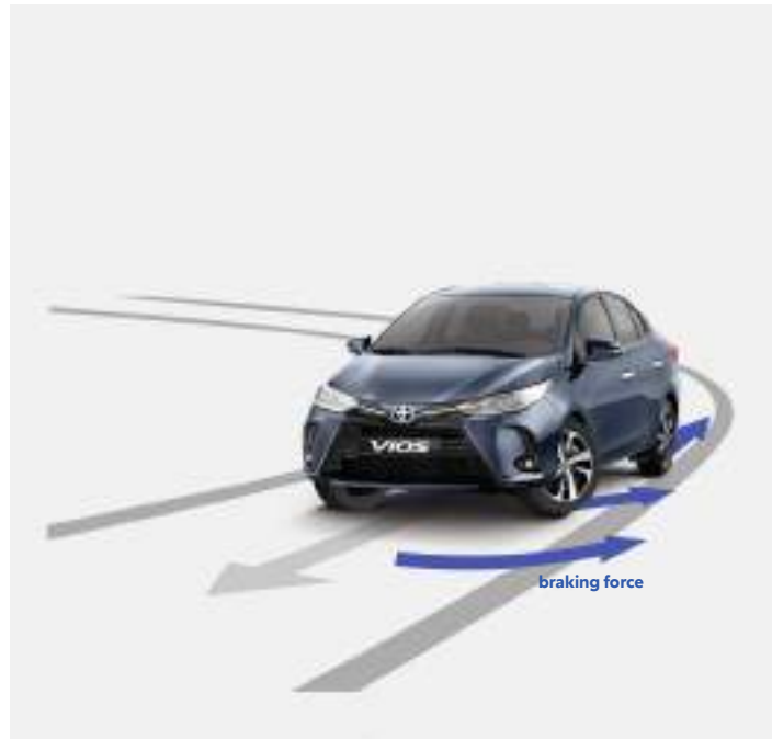
ELECTRONIC BRAKE DISTRIBUTION WITH BRAKE ASSIST This feature intelligently transfers most of the braking to the wheels that have more grip and provides additional brake force when the car needs to make an emergency stop.