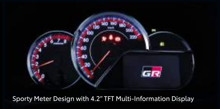
Sporty Meter Design with 4.2" TFT Multi-Information Display